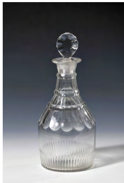
No. 293 $395 George III Decanter, scalloped lozenge stopper, neck fluted over three faceted rings cut from body to shoulder, comb flutes to base. English c. 1800.