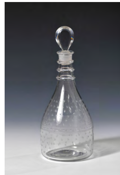
No. 294 $750 George III Decanter, lozenge stopper, three applied knife-edge rings, tapering body wholly engraved with stars above and below central band of egg and star. Irish, Belfast c. 1780.