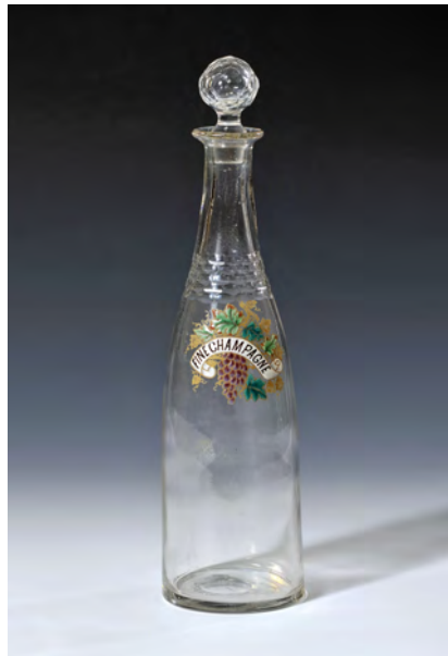
No. 283 $350 Champagne Decanter, faceted hollow ball stopper, tall slender body with faceting at neck, enamelled fruiting vine label Fine Champagne, demi-crystal probably Bohemian c. 1880.