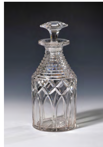
No. 307 $325 George IV Decanter, hexagonal cut stopper, sectional prism cut neck to shoulder, straight sided cut with flat lozenges interlocking with plain arch panels, radial prism base. English/Irish c. 1825.