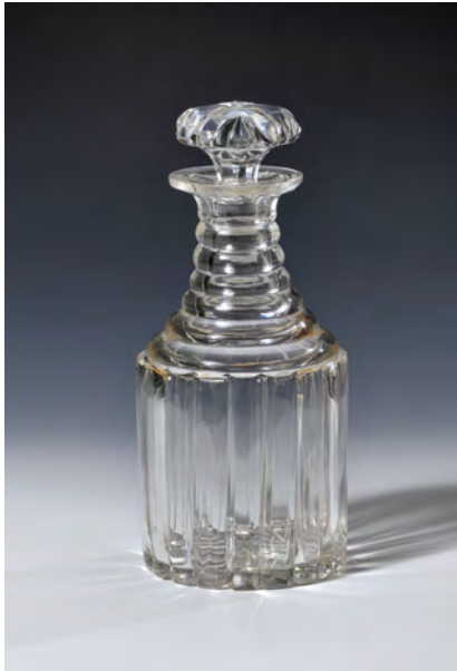
No. 308 $375 George IV Decanter, pillar heart cut mushroom stopper, cut pillar rings to neck and shoulder, straight sided with cut vertical pillar flutes running under base. Anglo-Irish, Waterford c. 1830.