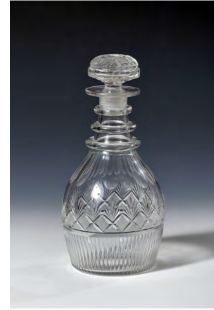
No. 303 $375 George IV Decanter, hollow strawberry diamond cut mushroom stopper, three plain neck rings, flat flutes at shoulder, fine finger flutes at base with band of fan and strawberry diamonds at centre. English/Irish c. 1820.