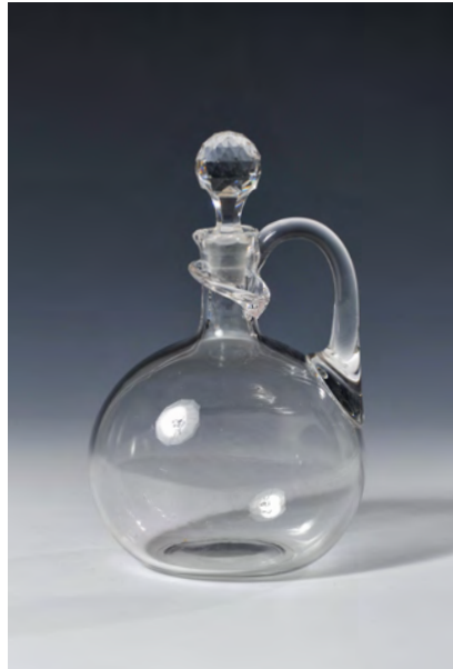
No. 309 $545 Victorian Claret Jug, facet ball stopper, short neck with applied slanting return drip ring and plain loop handle to plain bun shaped body, polished out pontil base. English c. 1880.