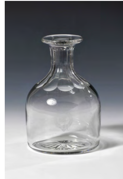
No. 299 $245 Edwardian Large Carafe, fluted short neck to plain cylindrical body with acid etched logo 'Houlder Line of Steamers' within belt with central flag, star cut base. 1 liter. English c. 1900. (Houlder Line 1856 – 1987).