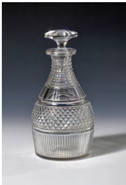
No. 304 $395 Regency Decanter, hexagonal cut stopper, three plain rings at neck, sectional prism cut neck, flat flutes above broad band of diamonds and prisms below. English c. 1815.