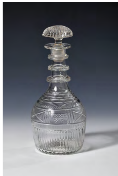
No. 297 $595 George III Decanter, moulded mushroom stopper, three milled double neck rings, facets at shoulder above band of star and saltire panels, rib moulding to base and beneath. Irish, possibly Cork or Waterloo c. 1800