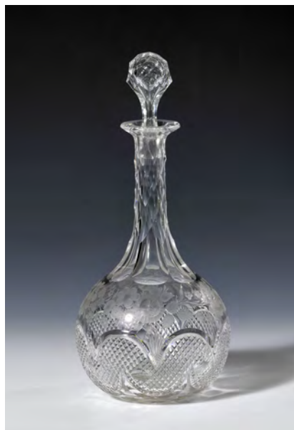
No. 291 $295 Victorian Decanter, facet hollow ball stopper, faceted tall neck, onion body engraved floral band above diamond filled waves with windows. English c. 1860.