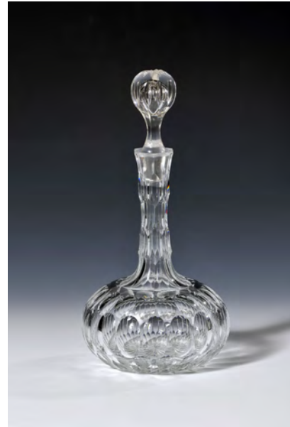
No. 290 $495 A PAIR of Victorian Decanters, cut ball stoppers, tall faceted necks, onion bodies with three rows of thumbprints, star cut base. English c. 1860.