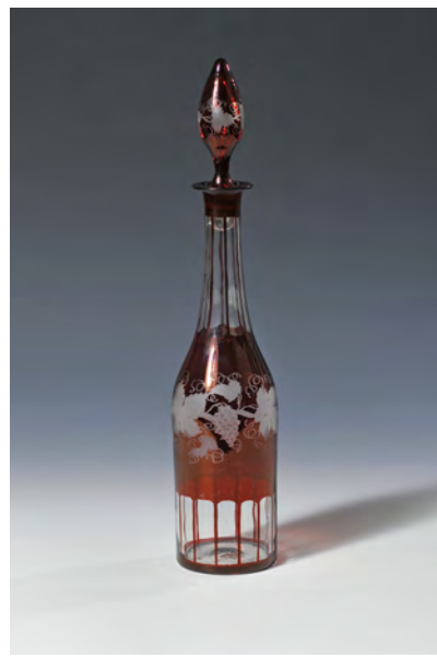
No. 284 $275 Wine Decanter, pinnacle stopper, tall slender body with fruiting vine engraved through red decorative flashing. Bohemian c. 1880.