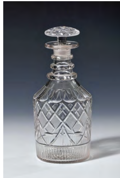
No. 301 $275 George IV Decanter, strawberry diamond cut mushroom stopper, three plain neck rings, one row of plain diamonds and one of strawberry diamond cut with flat flutes above, fine flutes below, star base. English c. 1825.