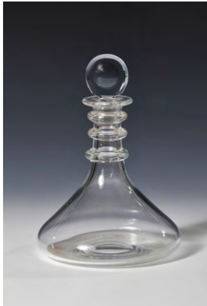
No. 298 $495 George III style Ship's Decanter, bull's-eye stopper, three applied plain neck rings, plain swept wide spreading body, polished pontil beneath. English, probably Brierley Crystal c. 1930.