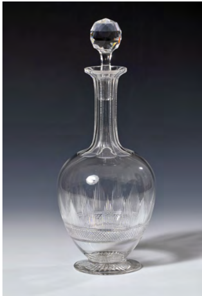
No. 287 $165 Late Victorian/Edwardian Decanter, facet ball stopper, tall fluted neck, oviform body with band of fine diamonds and blazes, on star cut foot. English c. 1900.

Of the three 20th century decanters in this offer, one is a ship's decanter, among the most coveted styles.