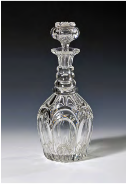
No. 286 $395 George IV Decanter, cushion stopper, neck with four horizontal pillar rings, shouldered body with heavy pillar topped arches, prism cut base. Anglo-Irish, Waterford c. 1830.