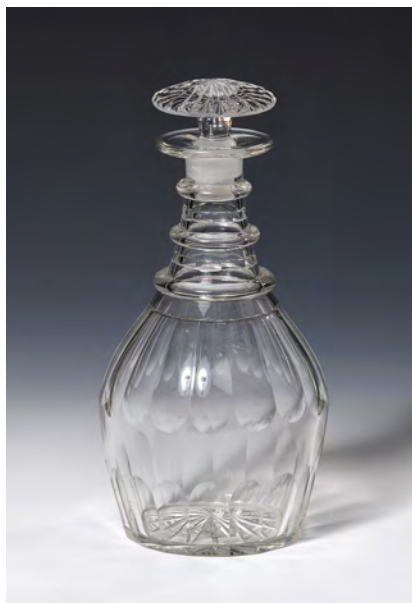
No. 141 $425 Regency, club, mushroom stopper, 3 neck rings, broad flat finger flutes to shoulder and at base, radially prism cut. English c. 1810.