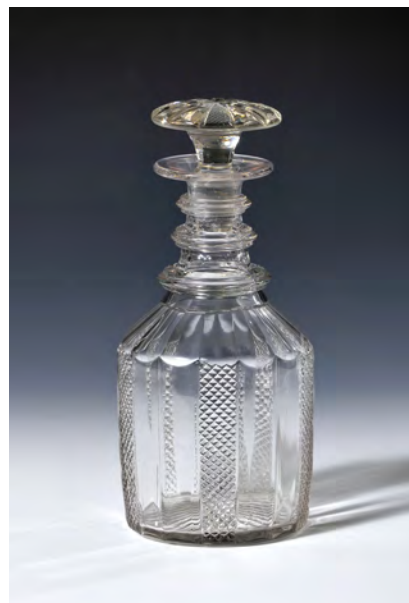
No. 306 $395 George IV Decanter, matching cut mushroom stopper, three triple rings applied at neck, flat flutes at shoulder, straight sided cut with pairs of plain pillar flutes separated by diamond cut narrow panels. Irish probably Waterford c. 1825. Ex-John Bailey Collection.