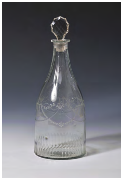
No. 274 $495 Louis XVI Decanter, faceted stopper, the tapering body with flutes above and below a central band of mixed polished and engraved foliate swags. Soda glass. French c.1780.