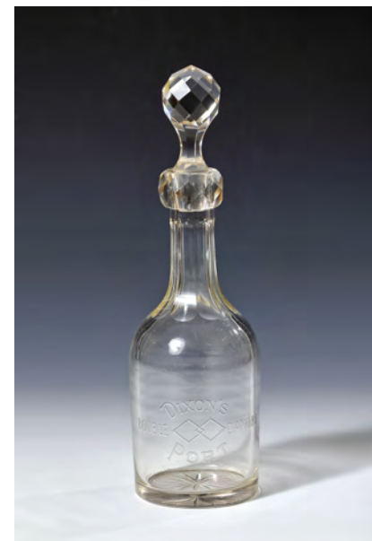
No. 285 $295 Port Decanter, facet ball stopper, faceted heavy ring at lip, fluted neck, plain shouldered body etched 'Dixon's Double Diamond Port', star cut base. English c. 1880. Mentioned in Dickens's Nicholas Nickleby chapter 37.