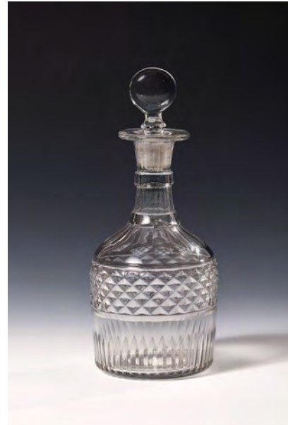
No. 211 $340 George IV decanter, barrel, mushroom stopper, 3 neck rings from the neck, flat flutes all between and hoops to shoulder and base. English c. 1820.