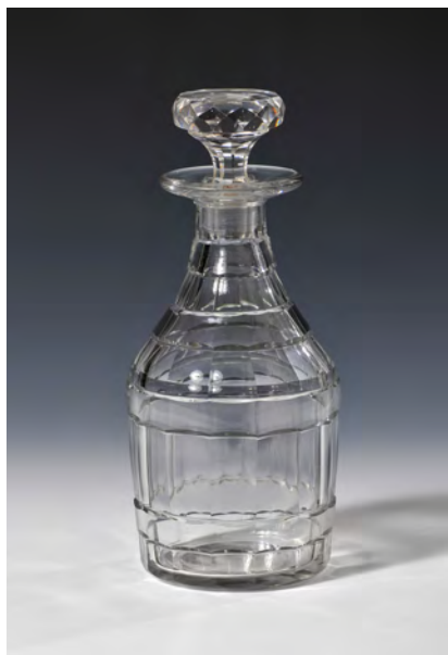
No. 302 $395 George III Decanter, facet edged flat solid stopper, two plain bands at the neck and two more on the body all cut from the body by vertical flat flutes between. English/Irish c. 1800.