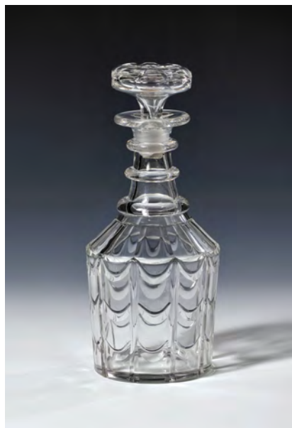
No. 305 $275 George IV Decanter, cut hollow mushroom stopper, three plain neck rings, flat flutes, straight sided with three separate rows of single swags within plain vertical panels. English/Irish (Waterford pattern book) c. 1830.