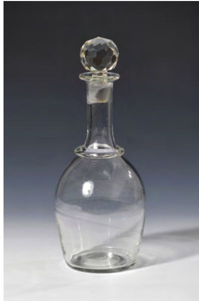
No. 289 $425 Large Decanter, facet ball stopper, tall neck with basal ring, shouldered plain body, polished out pontil. French c. 1860.