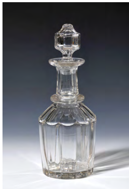
No. 292 $325 George IV Decanter, hollow blown cut pinnacle stopper, fluted neck with basal ring, straight sided body cut with broad pillar flutes, star cut base. Anglo-Irish, probably Waterford c. 1830.