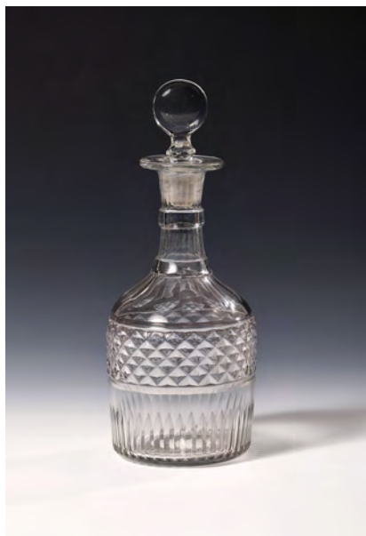
No. 204 $450 George III Decanter, straight sided, disc stopper, 2 flat rings from neck, flat finger flutes, broad band diamonds, short prisms at base. Irish c. 1795.