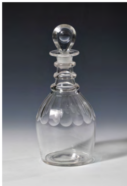
No. 296 $650 PAIR George III Decanters, lozenge stoppers, three plain neck rings, flutes to shoulders, plain bodies. English c. 1800.